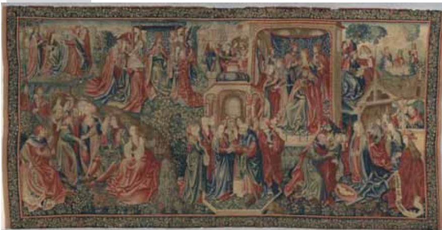
Episode from The Story of the Redemption of Man: Christ is Born as Man's Redeemer, 1500-1520, South Netherlandish, The Cloisters Collection , 1938

the Metropolitan Museum of Art, New York (Met). The collection at FAMSF comprises four tapestry panels from the Toledo Cathedral, which had been generously donated by the Hearst Foundation in 1954. And later, in 1992, an additional fragment showing one scene from the third panel in the series was also donated to the FAMSF collection. The panels at the Met were acquired earlier, in 1938. They are from a