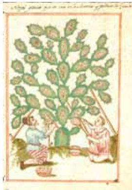
"The nopal plant that is grown in America and produces grana [cochineal]" Document from 1620-49. Newberry Library, Chicago, Vault Ayer MS 1106 D2.

Please contact Trish at the TAC office to make your reservations: tac@famsf.org ; 415-750-3627. Space is available on a first-come, first-served basis.