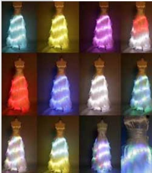
Color transformable dress

sports, smart clothing with sensors for healthcare, protective garments for extreme environments, and clothing for special markets. She has actively exhibited her designs nationally and internationally. She won the award for the best exhibition in the wearable computing design competition of the IEEE-International Symposium of Wearable Computers for her development of health care smart clothing, and she also won several other national and international design competitions. Her recent works focus on developing sustainable smart clothing by applying new technologies for advanced aesthetic and functional values.