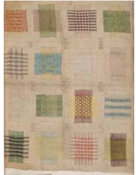
Darning Sampler 1