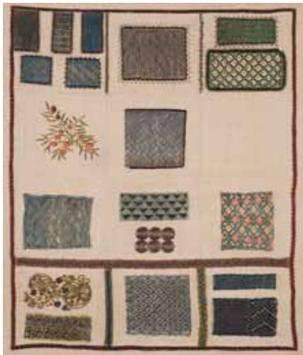
Royal School of Needlework Sampler

Samplers have been a staple feature of embroidery education for hundreds of years. This lecture features samplers from the Royal School of Needlework's (RSN) collection, which represent the 18th to the 21st century. The samplers represent many different types, not simply the classic "alphabet and numeral" pieces. These include band, map, darning, sewing, and technical stitch samplers.