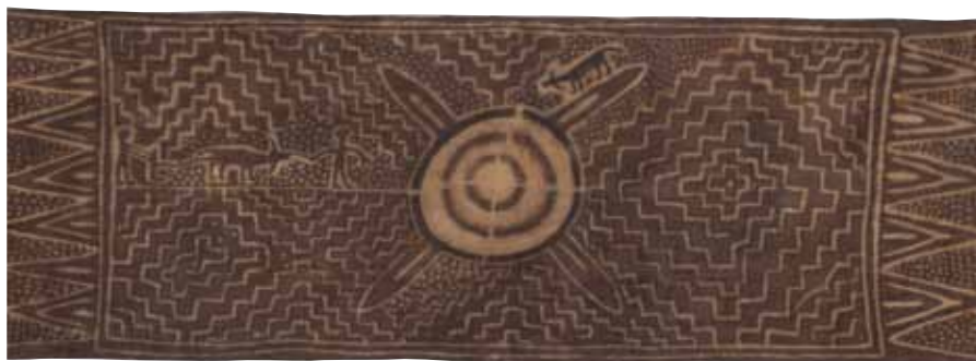
Sacred textile ( mawa' or maa' ) (detail), late 19th century, Indonesia, Sulawesi, Ma'kale area, Sa'dan Toraja people. Cotton, painted. 67.9 x 208.3 cm (26 3/4 x 82 in.) Museum purchase, Textile Arts Council Endowment Fund. 2014.28

This cloth depicts a buffalo, the ultimate symbol of wealth for the Toraja , plowing a rice paddy from left to right, following the movement of the deities, " liling deata ." This course runs clockwise and reflects the life affirming "Rites of the East, an action that brings blessings, prosperity, fertility, and fecundity. The mawa's center circle reflects the topography of the rice paddies but it also has further symbolic meaning. The circles represent the ponds in rice paddies where fish, a ceremonial food, are raised, a source of both physical and spiritual nourishment. A series of outer circles radiate from the core with each quadrant marked with the poignant directional marker of a buffalo ear. One of these ears is sprouting another buffalo, an added auspicious symbol. The four ears serve as a centering device that is believed to attract energy and is sometimes referred to as four winds or four directions. Furthermore, it references the virtuous aristocrat who sacrifices animals to his ancestors. The stepped diamond motifs, dots, and other markings fill the landscape and lead to the center. The small white dots have been interpreted as symbols of abundance; the stepped diamonds can be seen as terraced rice paddies but also reference the patola pattern, a prevalent motif in both Indonesian and Indian textile design. This combined imagery is believed to enhance the potency of this mawa' .