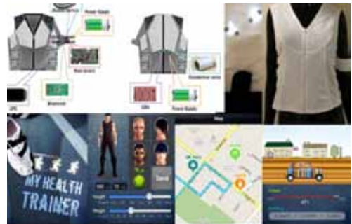
My health trainer