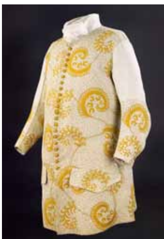
Waistcoat, 1725–1750, England. Linen, silk thread; embroidery (feather, cross, satin, buttonhole, and back stitch), silk thread covered buttons. 87.6 x 82.6 cm (34 1/2 x 32 1/2 in.) Museum purchase in Honor of John E. Buchanan, Jr., Textile Arts Council Endowment Fund. 2014.26

Embroidered à la disposition (in a set order), the stitches were applied to an uncut bolt of cloth in the shape of the pattern pieces before the waistcoat was cut out and sewn together. The continuation of the design around the back skirt of the waistcoat is evidence of high quality workmanship. This remarkable attention to detail is unusual for a garment typically seen only through the opening of a jacket.