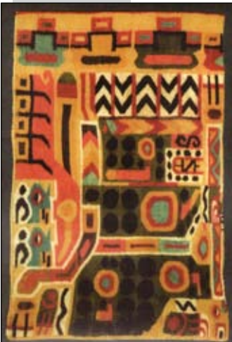
Winged Jaguar Staff-bearer from a Wari Tunic, 600-900 AD

Ancient Andean art and culture cultivated an intense symbolic identification with the animal world. Pre-Columbian societies, from Chavin to Inca, incorporated animals and animal imagery into ceremony and costume, ritual space and experience, social life and economy. Animals shaped Andean peoples' vision of themselves—and of their shamans and rulers, who were resplendent in fox skins, jaguar pelts, plumed headdresses, whiskered masks, and garments patterned with mythological and real creatures. Animals signified prestige, spiritual power,