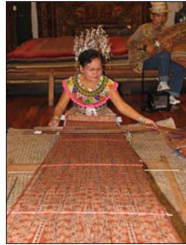
Iban weaver at the event